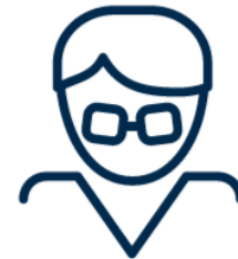
Mental Health Access