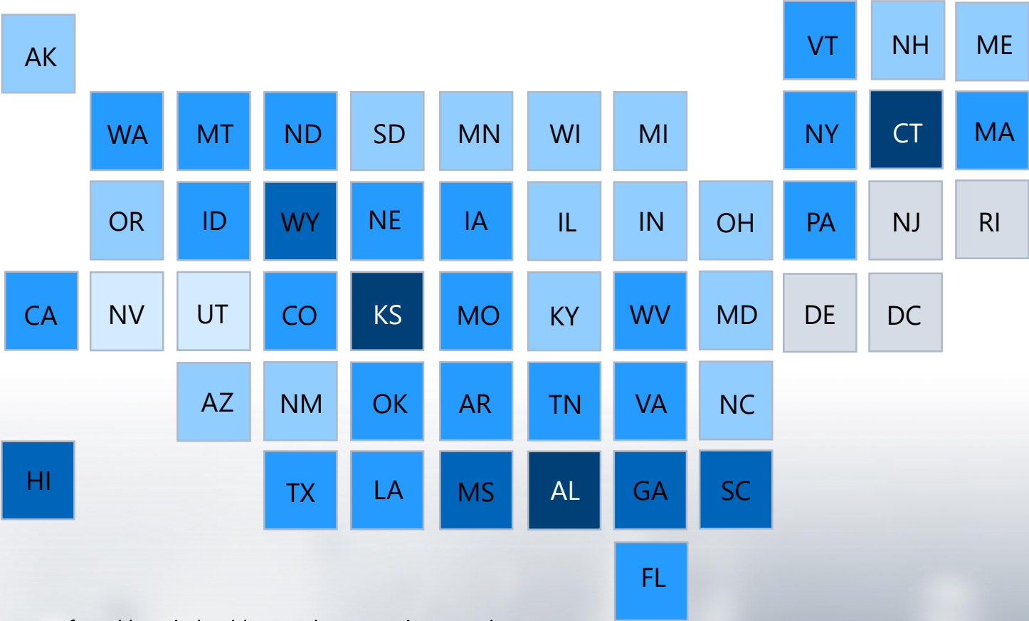
State-level percentage of rural hospitals with negative operating margin.